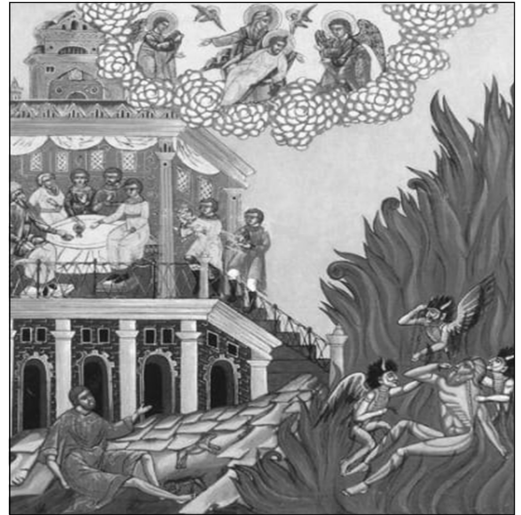
The Parable of the Rich Man and Lazarus

Where heaven is, and what exactly the “bosom of Abraham” will look and feel like are unknown. What is known is that heaven will be a place of joy, hell will be a place of torment, and our assignment to one or the other will be based on love, or indifference.