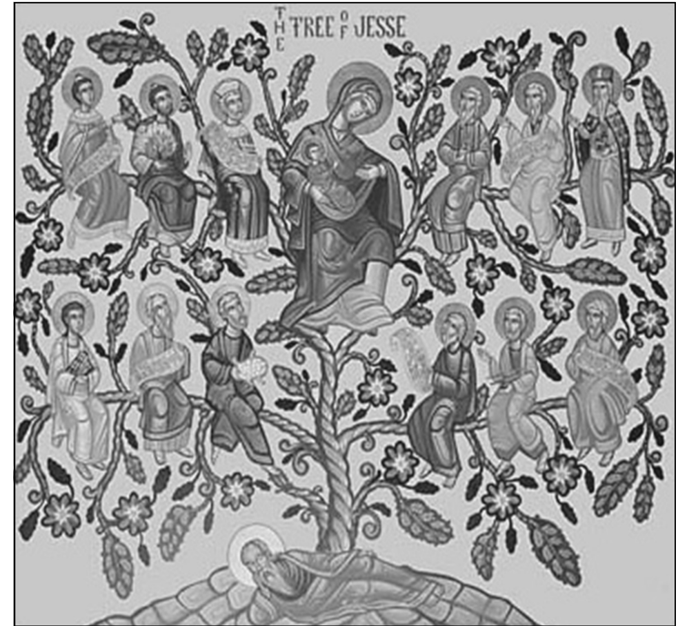
The Eve of the Nativity The Genealogy of our Lord Jesus Christ

This shows that salvation is not something offered only to the people of a certain nationality or ethnic group, but is open to all of humanity.