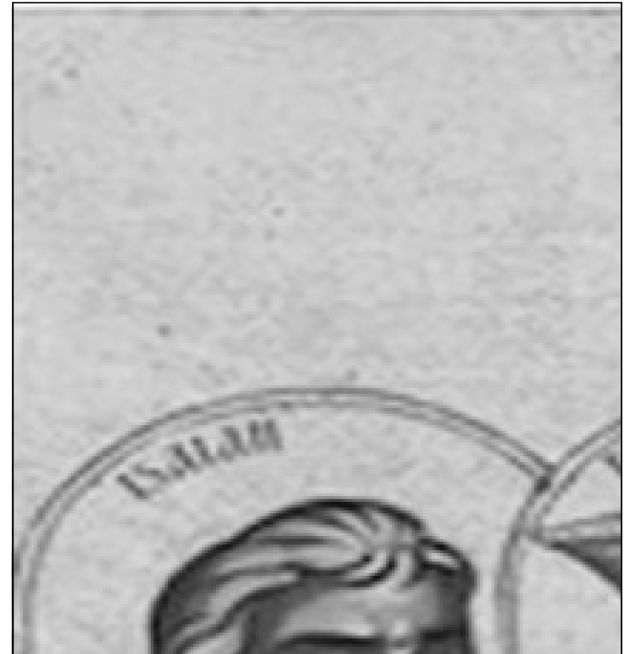
The Sunday of the Holy Forefathers (Ancestors) of Christ

The good news is that Christ is born to restore us to the blessedness for which He breathed life into us in the first place. He calls us all through His birth, but now we must choose to lay aside our obsession with earthly cares in order to accept the invitation to His great banquet. He is coming, and we will judge ourselves by how we respond to Him.