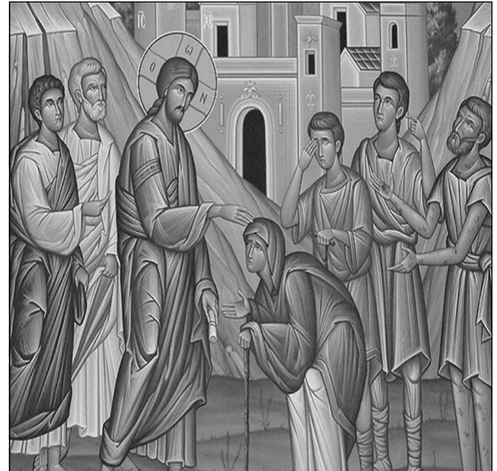
Christ Healing the Woman with Infirmary

The Church gives us new strength for us to grow spiritually, to ascend from "strength to strength," becoming more and more straightened out, and becoming all the less mindful of earth and appealing more to heaven. The closer man is to God, the more he feels his own sinfulness, but he simultaneously grows towards and feels God's closeness. And then repentance becomes joyful, like recovery after a long illness, as a straightening up after many years of being abnormally bowed down.